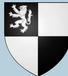
John Byng Viscount Torrington Coat of Arms

It was always the intention to make this committee into a separate charity, due to it catering for those who were only interested in the historical value of the grade 2* listed building.